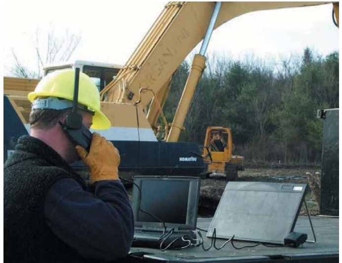
Project engineer on job site using the Portable Energy System

The SunWize™ Portable Energy System converts sunlight directly into electricity, allowing you the freedom to recharge your Globalstar handset anywhere the sun shines. Used in direct sunlight, the system's power output is able to operate your handset indefinitely. The system is lightweight, weather-resistant and highly durable. The Portable Energy System is indispensable for traveling business people and field workers in the construction, oil & gas, disaster relief and insurance industries as well as military personnel. This portable power source is UL listed.