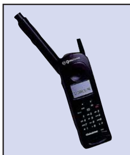
Qualcomm GSP 1600 Tri-mode Globalstar/CDMA/AMPS

The SunWize Portable Energy System is designed for daily field use. The solar panel is constructed using a proprietary process in which highest efficiency, single-crystal photovoltaic cells are permanently encased in rugged, weather-resistant urethane plastic. The panel's eight-foot cord winds on a spool recessed into the back of the panel. A hinged metal stand folds flush into the panel's back side. A diagram showing how to connect the SunWize Portable Energy System to a handset or other device is permanently printed on the back of the panel. The system weighs just over two pounds and measures 15.5" x 10.5" x 0.675". The voltage controller weighs four ounces and measures 4" x 2.5" x 0.675".